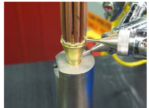
Two applicator guns dispense 360° stripes of brazing paste to all joint areas.