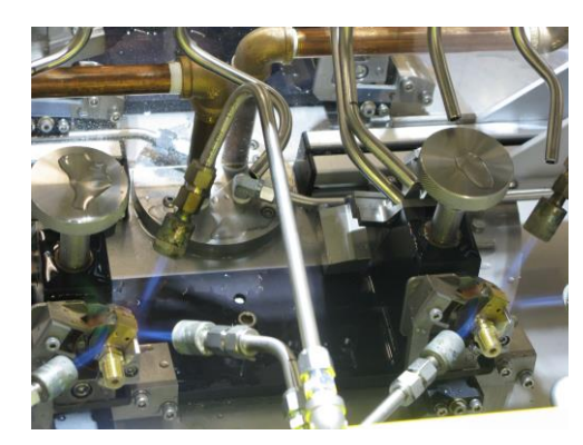
Oscillating burners distribute heat evenly throughout joint area.